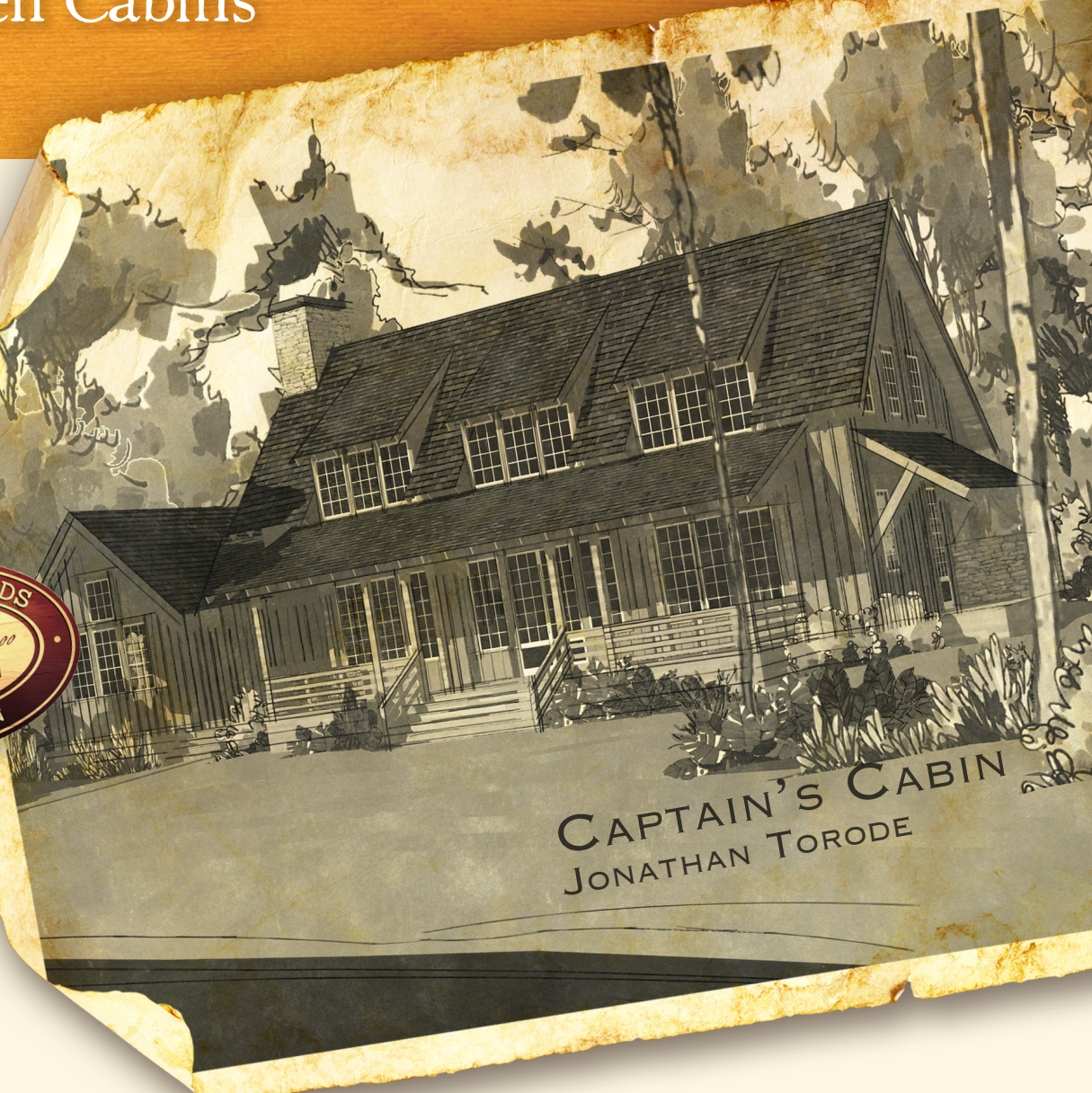
CAPTAIN'S CABIN JONATHAN TORODE