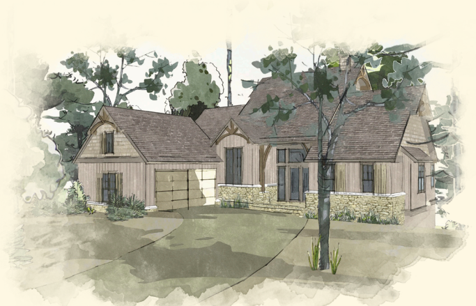
Street Side Elevation

For additional information about Russell Lands neighborhoods, call 256.215.7011 or visit www.RussellLands.com .