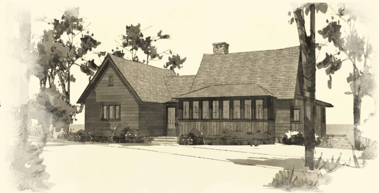
Street Side Elevation

PRICE: Pricing will depend on final features and lot selection.