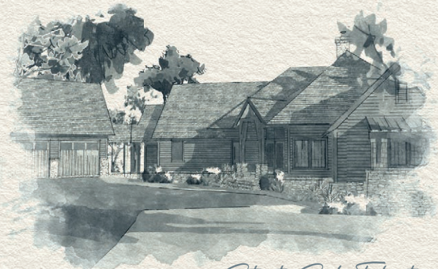
Street Side Elevation

Price: Pricing will depend on final features and lot selection.