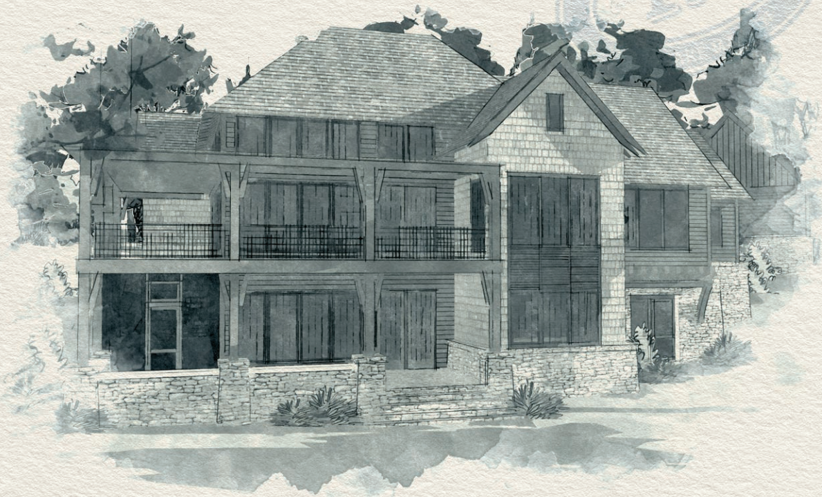
Lake Side Elevation