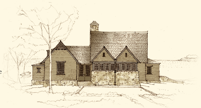
Street Side Elevation

PRICE: Pricing will depend on final features and lot selection.